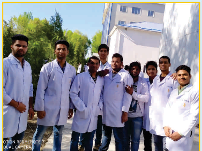
MORE THAN 2500 INDIAN STUDENTS