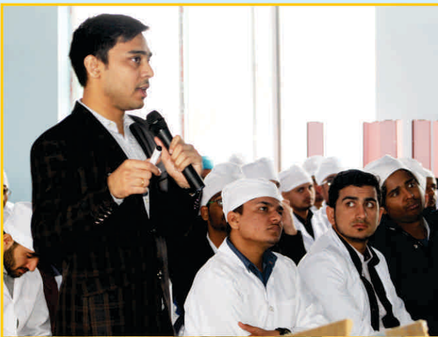
MCI COACHING BY INDIAN DOCTORS