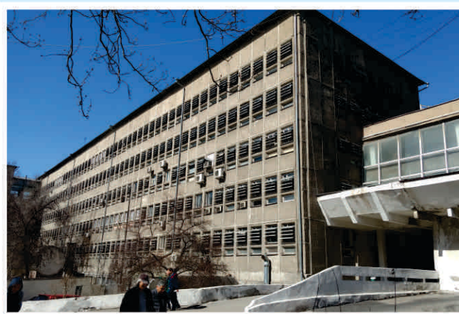
HOSPITAL FOR PRACTICE