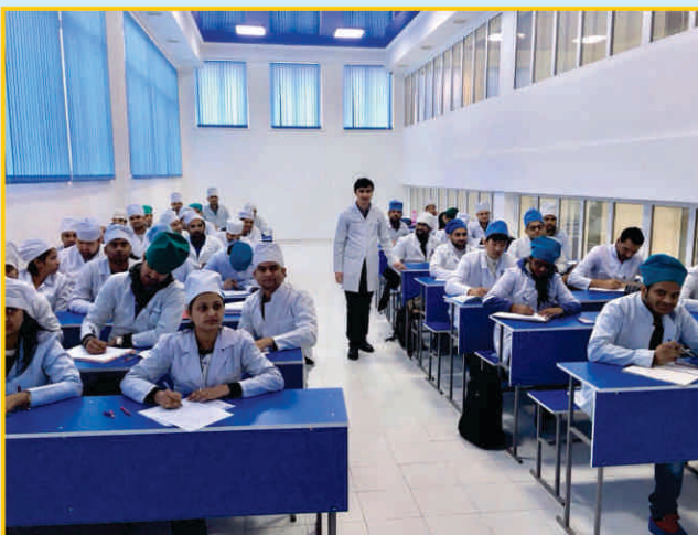
FULLY ENGLISH MEDIUM STUDY