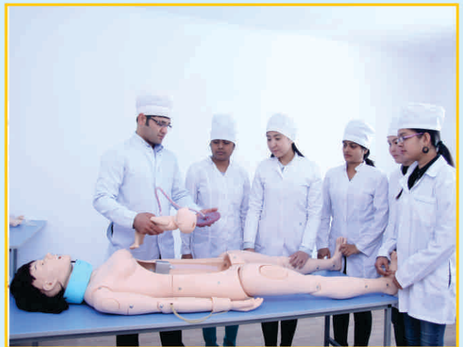
ONLY 10 STUDENTS IN 1 GROUP