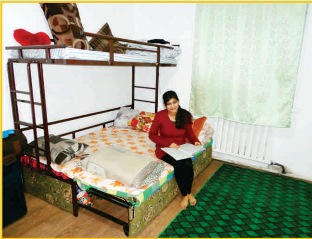
SEPARATE GIRLS & BOYS HOSTEL