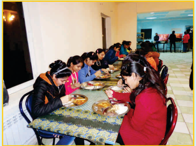
INDIAN FOOD IS AVAILABLE